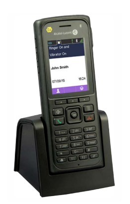
8262Ex DECT Handset